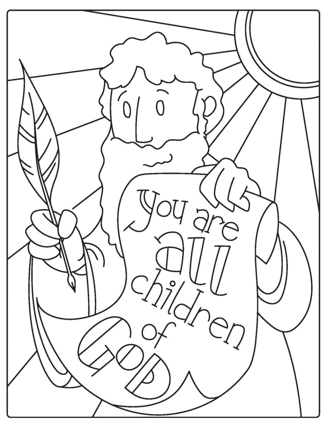
Galatians 3:23-29 · illustratedchildrensministry.com