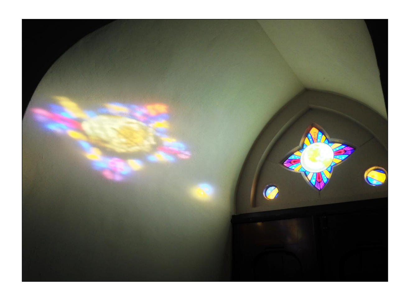
Rye Presbyterian Church 882 Boston Post Road Rye, New York, 10580