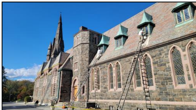
Painting the RPC trim before winter arrives.