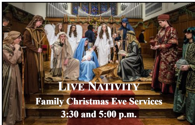
LIVE NATIVITY Family Christmas Eve Services 3:30 and 5:00 p.m.