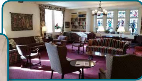
Church library renovated