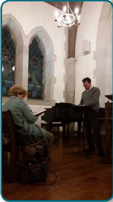
With new lighting, the chapel renovation is now complete