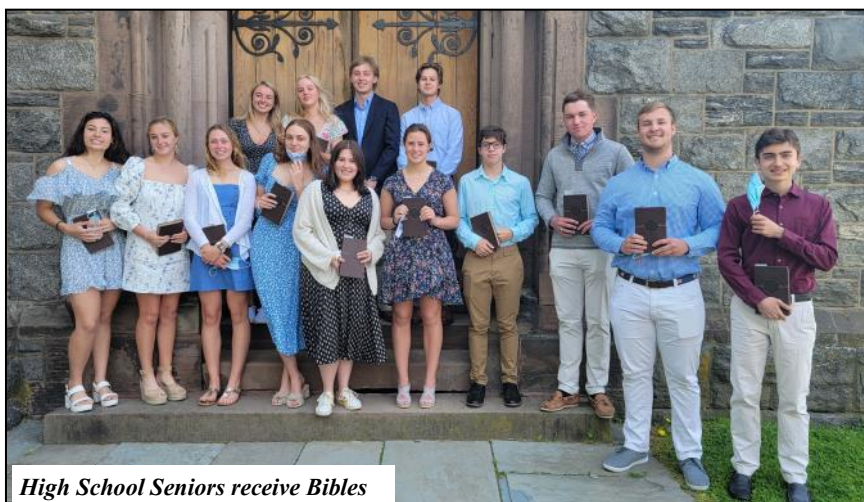
High School Seniors receive Bibles