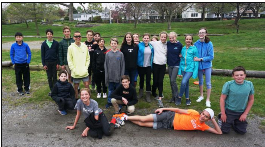
Connection—the Middle School Youth Group—enjoy time together following their experience at the Rye Town Park labyrinth.

Please email your name and phone number - jmarshall@ryepc.com .