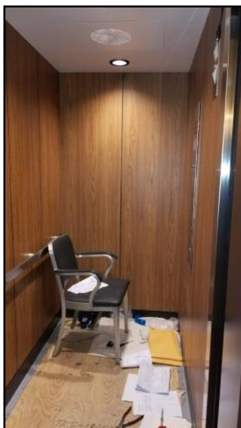
Elevator in progress!