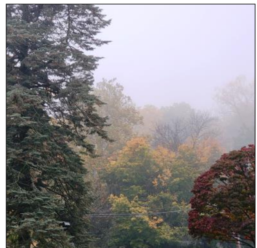
Fall arrives at RPC