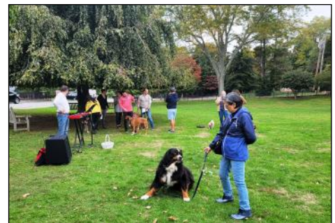
Blessing of the Animals— Sunday, Oct. 16

Sundays, November 6 & 20, 5:00 p.m. Westminster Room