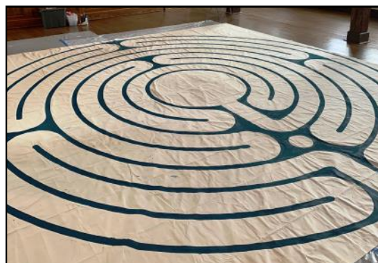
The High School Youth Group painted the church's new labyrinth, which was purchased with Imagine funds.