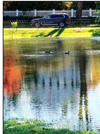
Hurricane Ida creates a temporary new waterline on the RPC Great Lawn, taken advantage of by a few ducks!