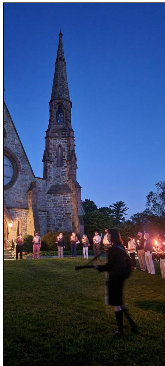
Interfaith service for the 20th anniversary of 9/11 at Christ Church.