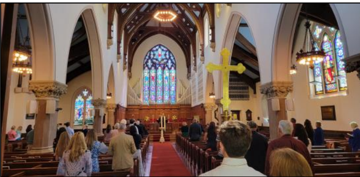
Sept. 26, Crucifer returns to the Sunday morning service.

As mentioned above, live-streamed worship will continue this fall and will become a permanent feature of RPC. The installation of a permanent system in the sanctuary with multiple cameras, more microphones, and an upgraded sound system has been completed. The live feed will be available for now on Zoom and YouTube. But, if you don't have computer capability you can also dial in to hear the service on your phone. That information is in the box below. A special thank-you to the virtual worship crew, the Worship & Music committee, and the in-person usher corps for working so hard to make worship in the Covid-19 era go so smoothly!