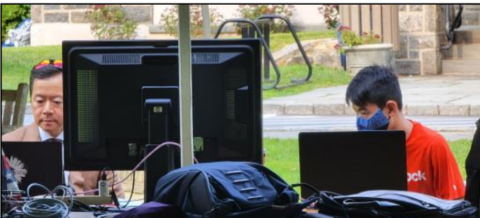
The tech team at work streaming Sunday worship to homes!