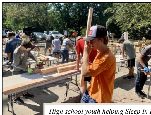
High school youth helping Sleep In Heavenly Peace build beds!