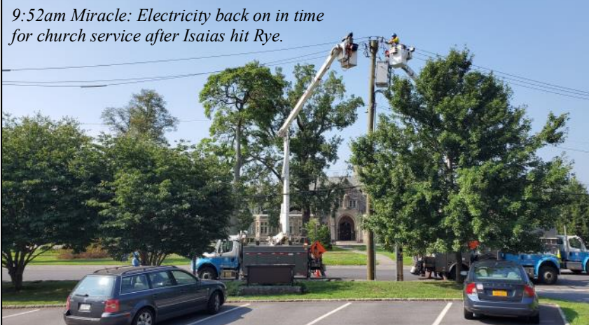
9:52am Miracle: Electricity back on in time for church service after Isaias hit Rye.

DIAL IN TO SUNDAY WORSHIP! To attend worship by using your phone, call 1-646-558-8656 then enter this Meeting ID: 560 770 303