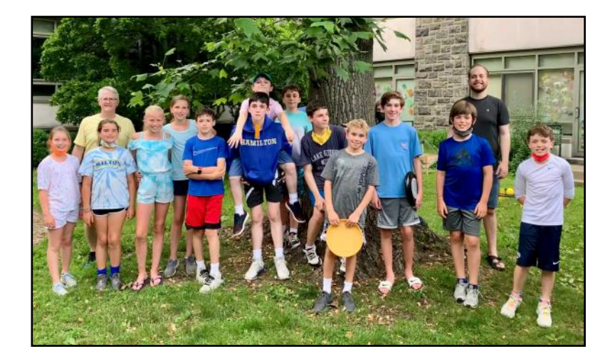
On Wednesday, June 9, Middle School Connection met under the Grape Arbor for an evening of good food, lawn games, and end-of-the-year fun!