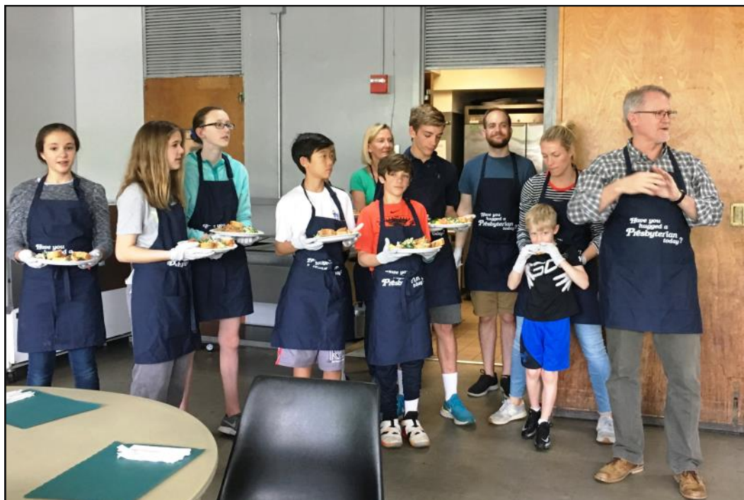
Connection, RPC's middle school youth group, helped those in need at "Dinner at Noon" at the Port Chester Carver Center on Saturday, May 18.